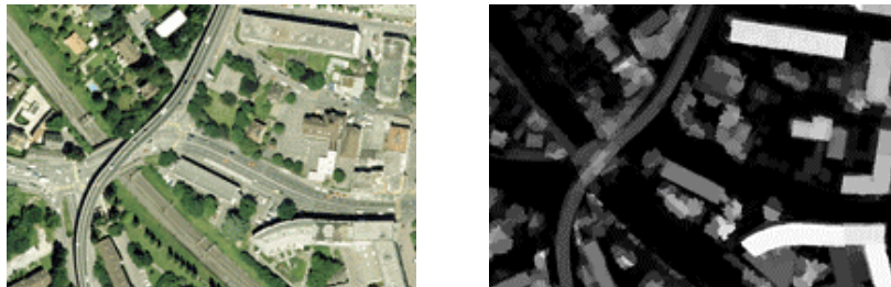
Figure 2: The meadows appear in black as the DHM value equals 0 and the trees brighter as the values are higher

The Digital Elevation Model has been used to discriminate the objects according to their height. For example, even if the spectral information of trees and grass is similar, they could be easily differentiated with the Digital Height Model value (DHM, Figure 2). The same approach could be applied to buildings vs roads.