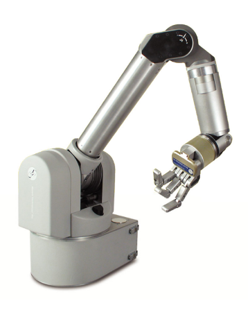
Fig. 5. Barrett Technologies Whole Arm Manipulator (WAM)

A Barrett Technologies Whole Arm Manipulator (WAM) with seven anthropomorphic degrees of freedom (three in the shoulder, one in the elbow, three in the wrist, see figure 5) together with the three-fingered Barrett hand provide UMan 's dexterous manipulation capabilities. The new lightweight design of the WAM has very low power consumption and is thus well-suited for mobile applications. All electronics for the control of the arm are built into the arm itself, facilitating its integration with a mobile platform. The WAM provides good dynamic performance and torque sensing in its joints. It is thus capable of using all of its links to perform force-controlled manipulation tasks.