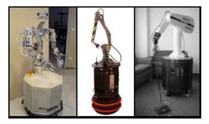
Fig. 4. Examples of mobile manipulators: ARMAR (University of Karlsruhe), PANDI1 (Örebro University), SAMM (Stanford University)

At the same time, we focused on the use of commercially available components. This facilitates recreating our results, as well as encourages standardization in robotics hardware. We justify this choice with the following observation: NASA researchers at JSC were able to perform dexterous manipulation tasks by teleoperating Robonaut. In particular, they teleoperated Robonaut to perform complex maintenance tasks on a model of the Hubble space telescope [1]. These experiments demonstrate that existing hardware is in principle capable of performing complex dexterous manipulation tasks. Consequently, we believe that algorithmic aspects currently represent the most important challenge in autonomous mobile manipulation.