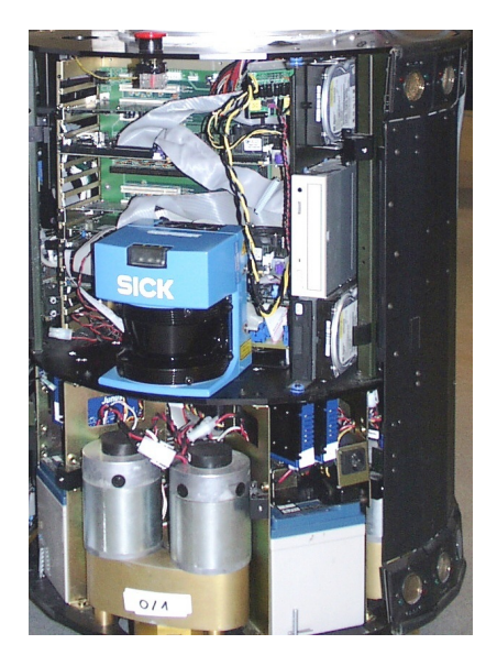
Fig. 7. UMan's interior

The other PC is running Linux and is dedicated to higherlevel tasks, such as vision processing, navigation, motion planning, and task planning. Both computers are connected via a dedicated wired Ethernet link. Wireless Ethernet connects both computers to the off-board computing resources. Should additional on-board resources become necessary, we could place laptops inside the cargo bays of the XR4000 mobile base.