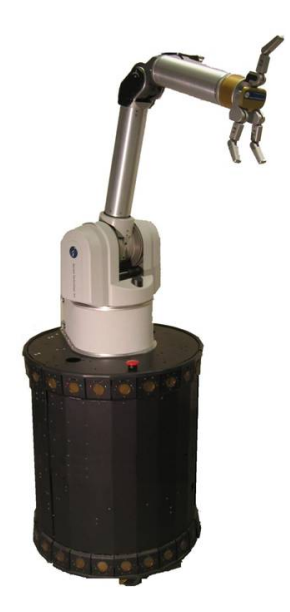
Fig. 1. UMan, the UMass Mobile Manipulator

the robot. Manipulation in combination with mobility thus requires algorithmic approaches that are versatile and general. The variability and complexity of unstructured environments also require algorithmic approaches that permit the robot to continuously improve its skills from its interactions with the environment. Furthermore, the combination of mobility and manipulation poses new challenges for perception as well as the integration of skills and behaviors over a wide range of spatial and temporal scales.