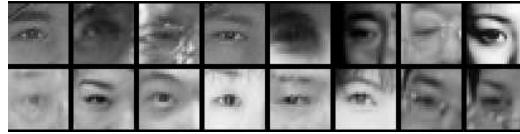
Fig. 2. Positive examples for right outside eye corner landmark.